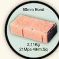
50mm Bond 2,11Kg 21Mpa 49/m.Sq