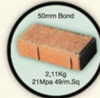
50mm Bond 2,11Kg 21Mpa 49/m.Sq