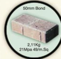
50mm Bond 2,11Kg 21Mpa 49/m.Sq