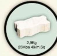
2,9Kg 25Mpa 49/m.Sq