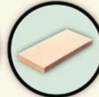
225mm x 450mm 50mm (Thick)