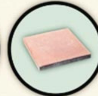
450mm x 450mm 50mm (Thick)