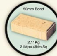
50mm Bond 2,11Kg 21Mpa 49/m.Sq