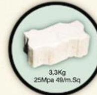
3,3Kg 25Mpa 49/m.Sq