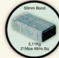
50mm Bond 2,11Kg 21Mpa 49/m.Sq