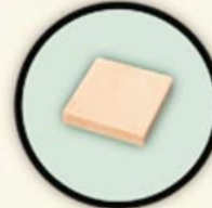
225mm x 225mm 50mm (Thick)