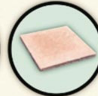
580mm x 580mm 50mm (Thick)