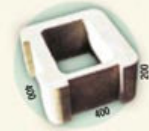
200 Pillar Corner 30.1Kg