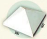
190 Pillar Capping 46Kg 30Mpa