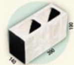
MA 140 13Kg 12.5/m.Sq 7Mpa