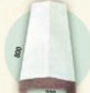
140mm Coping 20Kg 7Mpa