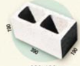
MA 190 16.2Kg 12.5/m.Sq 7Mpa