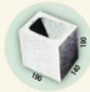
MA 140 Half 6Kg 7Mpa