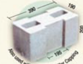
190mm Pillar 18.5Kg 7Mpa

Also covered with the 140mm Pillar Capping