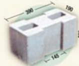
140mm Pillar 18.5Kg 7Mpa