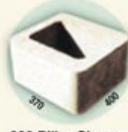
200 Pillar Closure 34Kg