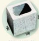
MA 190 Half 8.22Kg 5/m 7Mpa