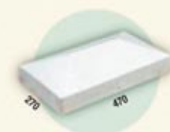
140mm Pillar Capping 20Kg 7Mpa