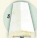
190mm Coping 20Kg 30Mpa